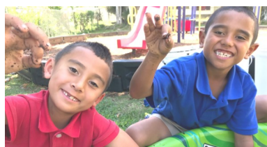
Students enjoyed harvesting the worm vermicast