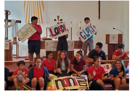
Grade 8 students organized & led a wonderful chapel for the school

In sixth grade social studies , we are currently learning about Mesoamerican Societies, specifically the Aztecs, Maya, and Incas. The sixth graders have learned about "The Ice