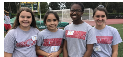
Grade 5 - 8 Enjoyed a Fun Day of Physical Fitness at the annual Track and Field Day

Saint Mark is still accepting new student applications Pre-K to Gr 8 for the 2019-20 school year