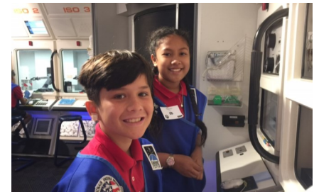
Grade 6 students enjoyed a visit to the Challenger Center Hawaii

Maiden", an Incan mummy found high atop Mount Ampato in Peru. Our seventh graders students are