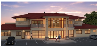
Rendering of the ELC

As the final touches are being put on Saint Mark's all new Early Learning Center, it is important that everyone realize that this amazing building is not just for pre-school students but is for the entire school to enjoy. Besides being home to the school offices, the upstairs of the ELC will be for K-8 usage beginning next school year.