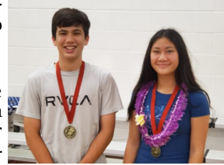
Congratulations to our two scholar athletes