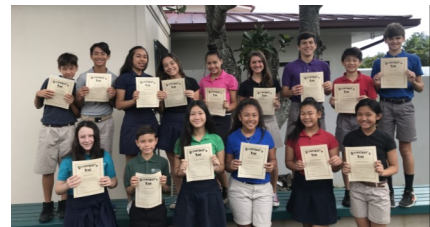
Congratulations to the middle school students who earned the 3rd quarter Principal's Award or spots on the Principal's List

Saint Mark Lutheran School NOW ENROLLING 247-5589 www.smls-hawaii.org