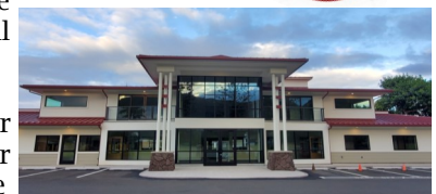
Recent Photo of the ELC