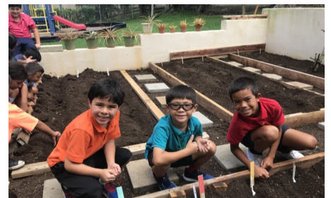
Grade 2 students joined other grades working in the school garden

on culture. Everyone is fitting in well, and I know it will be a super year in second grade.