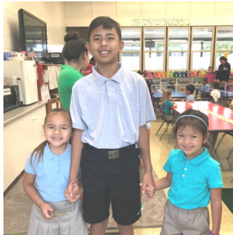
Kindergarten students got to know their chapel buddies

Happy 2018-2019 school year from the kindergarten classroom! We have enjoyed the first few weeks of school together. The kindergarteners have been hard at work learning new names and faces. We took a campus tour and learned where all