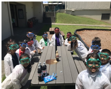
Grade 1 students doing an exciting science experiment

the classrooms are along with hallway and walking rules. Their favorite spot is the playground and the field! We have been working on reviewing our numbers, letters, phonetic sounds, and counting skills. They have all been working very hard and earning 'moolah' to redeem at the Treasure Box. We have had a few birthdays in August and it has been great celebrating with new and old friends. It is going to be a fantastic year!