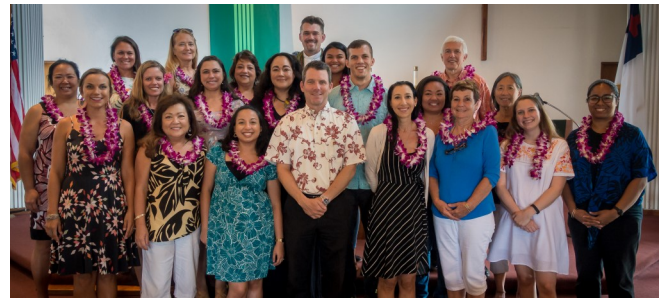
2018-2019 Faculty and Staff at the Installation and Rededication Church Service on August 5

Our first game is on Thursday, August 30 at Pearl Harbor. The game schedule is posted on the school website calendar. We are looking forward to a fun and exciting season!