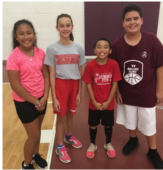
Students are happy that volleyball has begun

The eighth grade English class is getting reacquainted with Shurley, while jumping right into journal writing, vocabulary Wordly Wise and literature. We are reading the young adult book, Uglies , which is about a utopian society where everyone gets to become "pretty" on their 16th birthday. Should be fun!