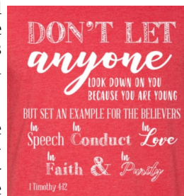
The 2018-19 'Ohana Groups Shirt Design