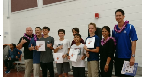
The varsity boy's basketball team and coaches at the Athletic Banquet