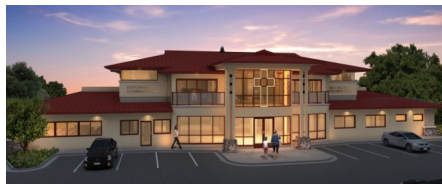
Latest Rendering of the ELC