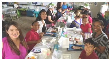
Grade 1 enjoyed a wonderful Mother's Day Tea