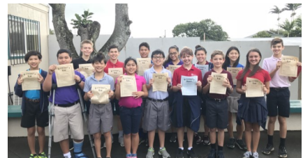
Congratulations to the middle school students who earned the 3rd quarter Principal's Award or spots on the Principal's List