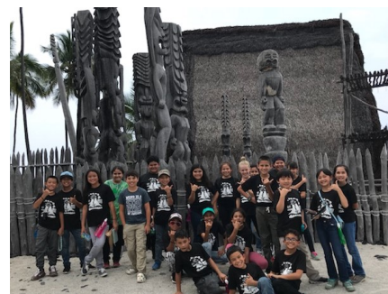
Grade 4 visiting Pu'uuhonua O Honaunau National Park on the annual Big Island Trip

Fourth Grade: The fourth graders had a three day educational trip to the Big Island. In Kona, they learned about the Hawaiian monarch at Hulihe'e Palace. They also visited the famous Pu'uuhonua O Honaunau National Park, otherwise known as the City of Refuge. The students then trekked 9,000 feet up Mauna Kea where they saw silverswords, and drank hot cocoa in