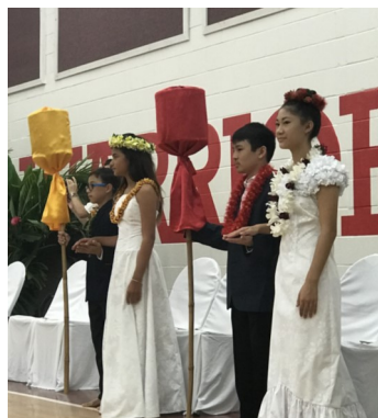
Some of the May Day Court at the beginning of our 2018 May Day Celebration

In eighth grade social studies , we've just completed our unit on World War One. We've learned