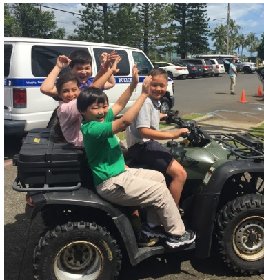
Students were thrilled to be checking out the police vehicles

Office hours during the summer break will be Monday - Friday from 8:30 a.m. to 1:30 p.m.