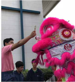
Middle school students enjoying a lion dance in celebration of Chinese New Year