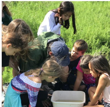
Grade 3 students look curiously at some marine life collected on their recent learning trip