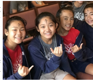
Middle school students on Ash Wednesday

Our eighth grade social studies students have just completed presentations on Google Slides about an important figure, invention, or battle of the Civil War that had a great effect on the outcome of the war. Next, we'll be taking information from these presentations and writing essays.