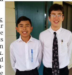
Middle school students dressing as "Professors" for Career Day