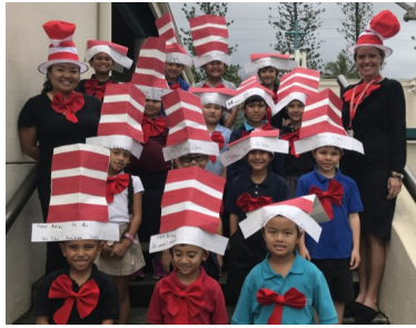
Grade 1 celebrating Dr. Seuss' Birthday

First Grade: The first graders have been busy learning about keeping their hearts healthy in science. They celebrated healthy heart month at our annual "Get Active"