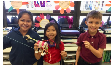
Grade 2 students with their animal discovery projects

event and potluck with the whole school. We participated in dental awareness month. The students also enjoyed a special Valentine Workshop that involved art, STEM, and a healthy snack. We harvested vermicomposting from our worm bin with our 2nd grade friends. In March, we celebrated the birthday of Dr. Seuss by Reading Across America throughout the week. The students collaborated with 3rd and 4th in stations and partner reading. We also enjoyed fried green eggs, spam and rice. We end this quarter with Spirit Week, All School Game Day and our 3rd Open Market. We have worked hard this quarter and look forward