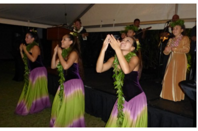
Keolaulani Hālau'Ōlapa O Laka performs beautifully at the gala

mately $30,000. We owe our special thanks to our Gala Committee and our Parent Teacher Committee (PTC) for their hard work!