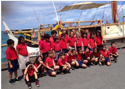
Grade 3 students on a recent trip to see the Hokule'a at He'eia Pier

Third Grade: October was an exciting month for third grade. We started the month going to see the Hokulea before it embarked on its world wide voyage. We worked on a "Still Life" project in art this month. Each student learned how to add shadows to their art work as well as learning to see basic shapes in objects. We ended the month by having an exciting visit from the Honolulu Police. Each student wrote a question to ask the officers during the visit. We enjoyed many interest-