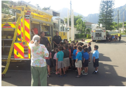
Kindergartners enjoying the visit from the Fire Department