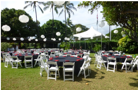
Sunset at last year's Annual Benefit Gala at the Pacific Club

Mahalo to all who have generously given so much (time, talent, and financial contributions) in support of this important event!