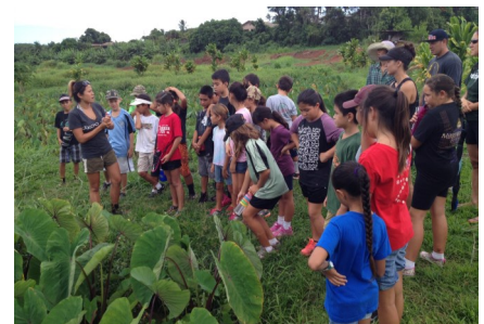
Grade 4 students enjoyed an educational trip to the He'eia Lo'i

and Introduced species to the islands. Students worked in pairs using iPads and books to categorize and discover an interesting fact about the plants and animals they got. Through a research project students will learn more about life science and what makes our islands home to many different species.