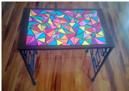
Class Project to be auctioned off at the upcoming Gala