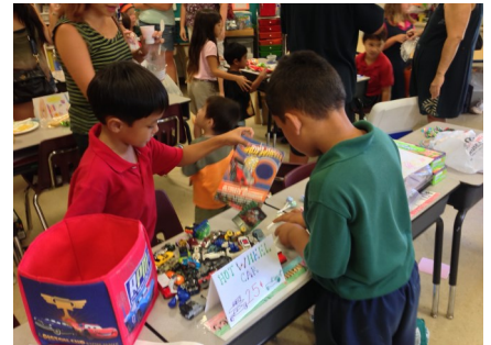
Grade 2 students at open market

Second Grade: The second graders have jumped right into the second quarter after their fall break, and are ready to learn! These second grade authors have been busy working hard in writing - remembering to include lots of interesting details in their stories. They are looking forward to learning how to add a bold beginning, a strong middle, and an excellent ending to make their story even better. The second graders are excited to put all their learning together, as they will be publishing a class book in the spring!