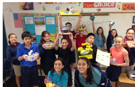
Grade 7 science class showing off their cell projects

In social studies , we are working our way through the American Revolutionary War and the Constitution of the United States. Seventh grade is currently delving into the geography of Canada, Mexico, and Central America. Social Studies for grade six involves the ancient civilizations of China and Greece.