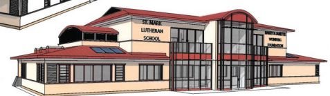
Renderings of the Early Education Center with 3 Pre-School Classrooms