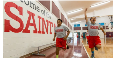
Grade 7 students enthusiastically getting some exercise during P.E.

Sixth grade world history students are studying core concepts of historical study and learning about the beginnings of civilization. They are also working on their five paragraph essay using the first city of Uruk to define a civilization.