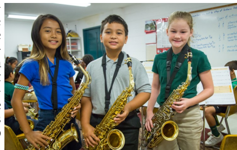
Grade 4 students showing off their saxophones during beginning band

Rocks are very important to our world and can be very interesting. We visited the Lucoral Museum to learn more about minerals; minerals are the ingredients that make up rocks. To learn more about the properties of