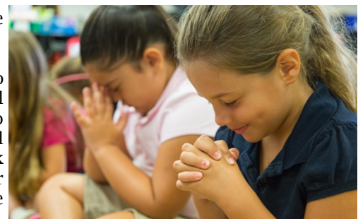
Grade 1 students spending some time in prayer during their morning devotions