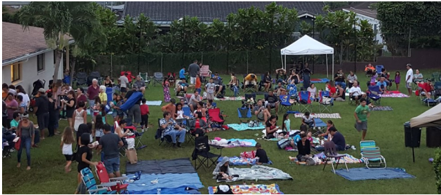
Families Gathering for Fall Family Night

The weather was beautiful, the food fantastic, and the movie delightful!