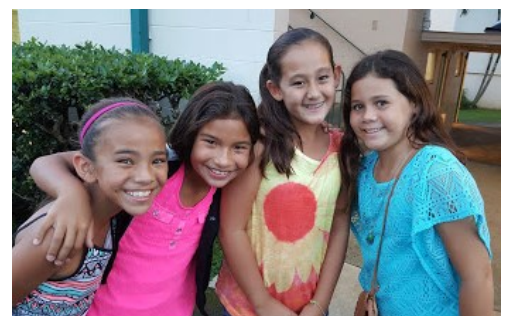
Grade 5 students enjoying themselves at the 2015 Fall Family Night