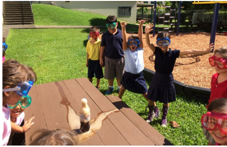
Grade 1 students excited about a fun science experiment

Math and Math Minute help strengthen those skills. In reading, we focused our word attack skills by