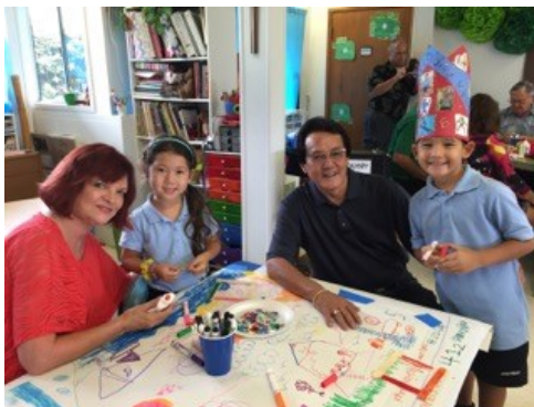
Kindergarten students enjoying a very special visit from their grandparents on Grandparents' Day

forms will receive their shots on Wednesday, November 18 . Those handing in late forms will be wait-listed to receive vaccinations if there is a sufficient supply.