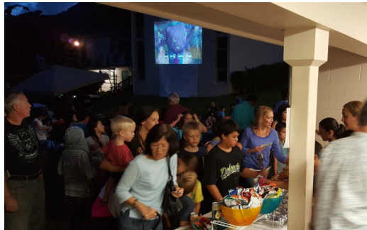
The grade 4 families raised over $2,000 for the students Big Island trip in May

This event reminded me how Saint Mark is a family oriented community that celebrates the 'ohana and tries hard to foster a collaborative environment where parents, grandparents, aunties, uncles, and friends can actively participate in the life of the school.