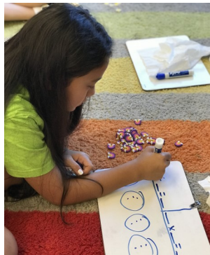
Grade 3 learning division during math stations

Third Grade: Third grade is excited to be back for the second semester! We have been reviewing our procedures and jumping right back into learning. We are trying to recognize a character's point of view of the story as we read. We have also started our division unit and students have been working hard at memorizing their math facts. In science we are