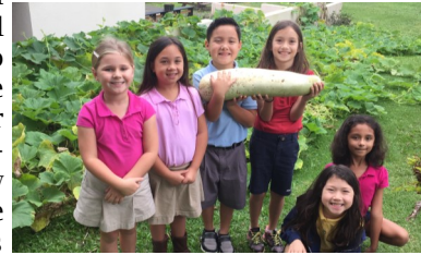
Grade 2 harvested some huge squash from their garden

the growth that occurred over winter break. They are excited to harvest the many squash that are growing. The students are also hard at work creating books using research they did on an animal of their choice. They learned so much about the different animals we have on our Earth and are excited to share their knowledge with others through their books. All year long