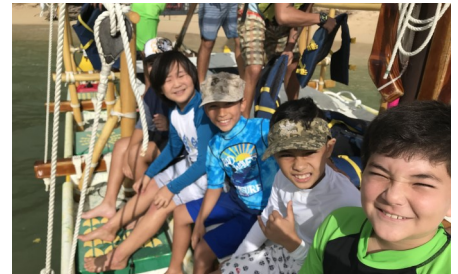
Grade 4 spent an educational day with the Kanehunamoku Voyaging Academy

Fourth Grade: The fourth graders are beginning long division in math. It has been difficult for some but they are up for the challenge! The fourth graders have also been busy learning about the water cycle both in English and Hawaiian. Each group designed their own water cycle poster. Last week, they learned about traditional Hawaiian navigation at Kualoa Regional Park with the Kanehunamoku Voy-