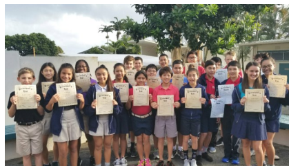
Congratulations to the middle school students who earned the 2nd quarter Principal's Award or spots on the Principal's List

Our January chapel offerings are going to Pennies for Patients. We hope to be as successful this year as we were last year.