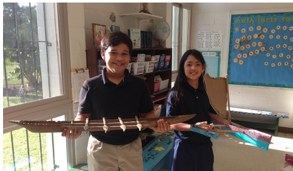
Grade 4 students showing off their hand made ancient Hawaiian canoes

from our book. Then we write something interesting about that character. We display our characters for others to read about and learn. In grammar and writing we are learning about adverbs and adjectives.