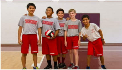
A few eighth graders paused for a picture during a recent P.E. class

Eighth grade U.S. history students have a tough decision this quarter. Are they a Loyalist or a Patriot? They will participate in debates, essay writing, and reading to learn the dual perspectives that arose during the American Revolution. They are reading the novel My Brother Sam is Dead , a historical novel about two brothers finding themselves on very different paths during the Revolutionary War.