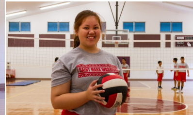
Two eighth graders enjoying volleyball