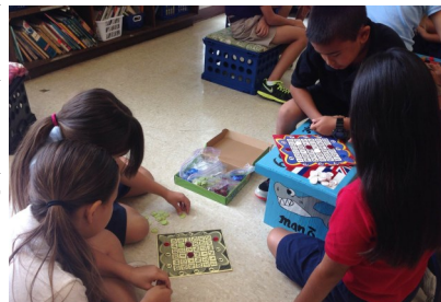
Grade 4 students enthusiastically enjoying an activity

the school year! Writing is a favorite subject among the students. They have produced some vivid journal entries and have started to write their first Authoring story. To help the students become detailed and descriptive