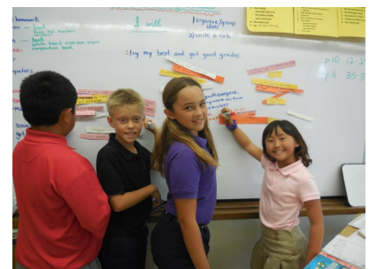
Grade 5 students collaborating to create a set of class rules

the most popular ones and created a list of rules for our classroom which we called Our Plans for Success . These included doing our best, studying hard for tests, being nice to each other, staying on task, being positive, and many more. The students are all excited about following these rules, so they can have a terrific year in fifth grade!