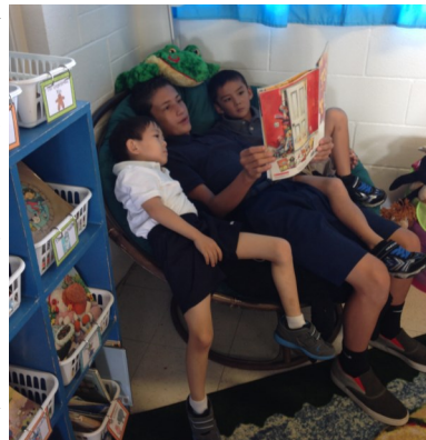
Grade 8 and Kindergarten with their grade 8 chapel buddy sharing a book together

Eighth grade Bible students have been getting to know their kindergarten chapel buddies and learning about the big responsibility they have as the oldest students on campus. We made a craft with our kindergarten buddies that we turned into cross necklaces that our buddies got to take home after our first chapel together. Then we made creation books and shared them with our buddies. It has been an enriching experience for all involved.