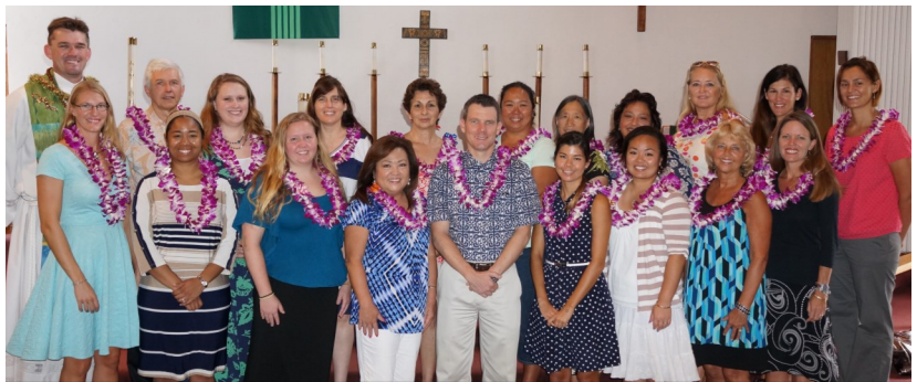
2014-2015 Faculty and Staff at the Installation and Rededication Church Service on August 3

The first game of the season took place on Thursday, August 21 at Saint Mark against Windward Nazarene. The rest of game schedule can be found on the calendar on our school website. So, check it out, mark the home games and come out and cheer on our Warriors!