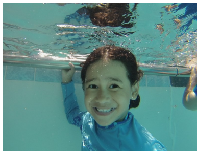
Grade 1 student pausing for and underwater picture on a recent swimming excursion

Kindergarten: On your mark, get set, go! Kindergarten is off to a fantastic start! The kindergarteners were excited to start kindergarten at Saint Mark Lutheran school. During these first weeks the students have been busy getting to know each other and making new friends, taking care of their class pets, Rocky and Stanley, and learning a lot about numbers and letters. They also got a chance to meet and spend time with their eighth grade chapel buddies. This month the kindergarteners can't wait to cool off from this heat and go swimming at the Kokokahi YWCA. They are looking forward to learning lots of new things together this year!