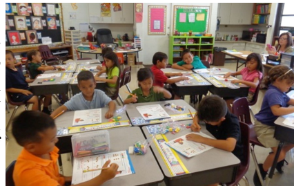
The grade 2 students using tiles to solve complex addition and subtraction math problems

Second Grade: Our super second graders have all done a wonderful job adjusting to their new classroom procedures and rules. They are off to a fast start as they wrap up their first chapter in math. They are also refining their writing skills everyday in their journals and are finishing up their community unit. This week marked the first week that homework was due and every student submitted and completed it on time! This month was also special for the class because they celebrated six birthdays. The students really enjoyed all the extra cupcakes and ice cream! They enjoyed their very first field trip to the Honolulu Theatre for Youth and they continue to show enthusiasm for the year to come!