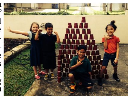
Grade 2 students celebrating the 101st Day of School

walking 100 steps, reading 100 words and sharing a snack of 100 things. We enjoyed an exciting field trip to Chinatown this past Monday in celebration of Chinese New Year. We had a blast!