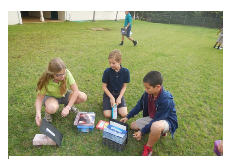
Grade 5 students participating in an outdoor science investigation