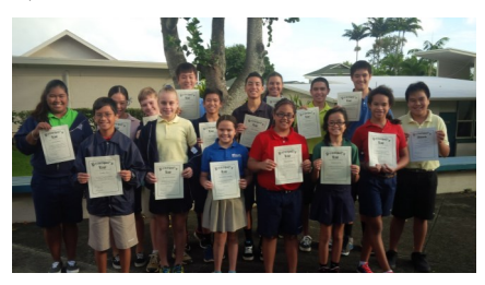
Congratulations to the middle school students who earned the 2nd quarter principal's award or spots on the principal's list

The response to our February chapel offerings has been wonderful! We've already collected over $300 for Pennies for Patients !