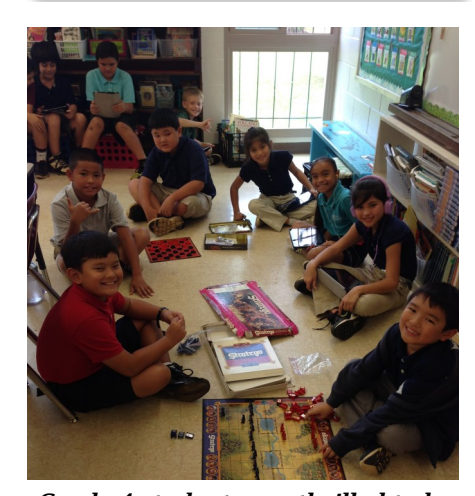
Grade 4 students are thrilled to be playing learning games

this topic and take full advantage of the many different places we can visit to have first hand experiences.