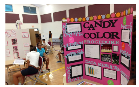
Middle school students sharing their science fair projects

Both the seventh and eighth grade English classes are starting new novels. Seventh grade will be reading <u>Rifles for Watie</u>, a fascinating look at the Civil War out west, and eighth graders will be enjoying <u>Shabanu</u>, the story of a young Pakistani girl coming of age in a place very different from ours. We will