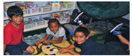
Grade 2 students enjoying a fun team building activity

Second Grade: Ready, set, go! Second grade is off to a fantastic start! The second graders have been spending their first few weeks of the year building their classroom community and learning new routines and expectations. They