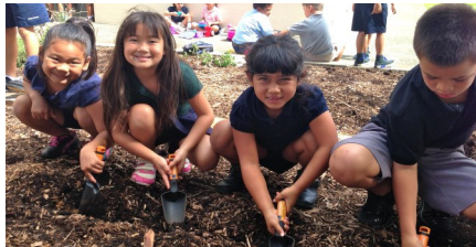
Grade 1 & 2 students working in new and expanded their garden