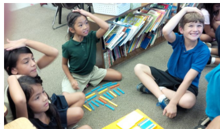
Grade 3 students enthusiastically enjoying a math activity

Third Grade: Third graders have been busy getting routines started for the school year. They are doing a wonderful job of keeping their desks orderly and coming to school ready to learn. Several students have already gathered some Accelerated Reading points as we enjoy using the school iPads in the classroom. Cursive is underway as we begin to work on posture, pencil grips, and