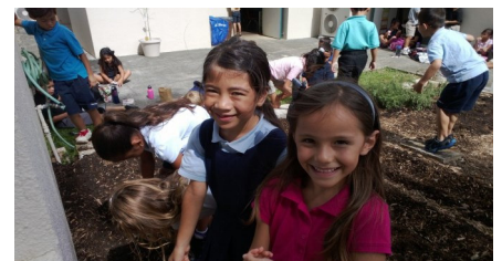
Students enjoying their garden

are excited about all the new learning. They also had a chance to get down and dirty in the newly expanded first and second grade garden. They are looking forward to their first harvest of the year, this fall. The second graders were also excited to welcome two new friends to their second grade ohana.