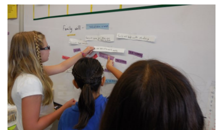
Grade 5 students collaborating to create a set of class rules

the most popular ones and created a list of rules for the classroom which we called Our Plans for Success . They included doing our best, studying hard for tests, being nice to each other, staying on task, being positive, plus ten more. They are all excited about following these rules, so they can have a terrific year in fifth grade!