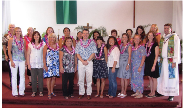
2013-2014 Faculty and Staff at the Installation and Rededication Church Service on August 4