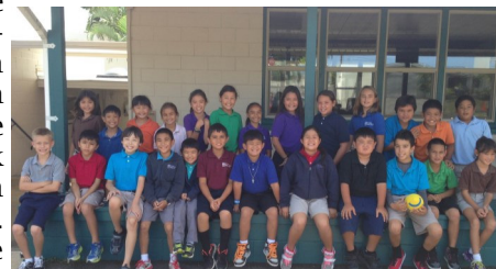
Grade 4 students pausing this week for a class photo

Fourth Grade: The 4th grade class has been very busy! All the stu-