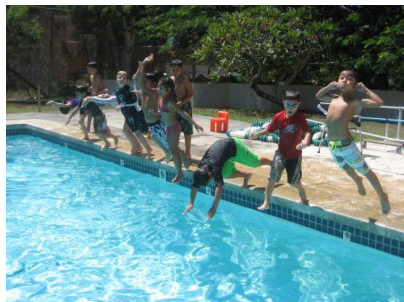
Grade 2 Having Some Fun at the Pool with Kindergarten

The end of our 1st quarter and the beginning of Fall Intersession are quickly approaching. Our last day of school is October 1, and we return on October 18.