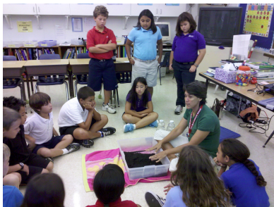
Grade 4 Student Exploring Hawaiian Geology

Report cards for students in grades 6-8 will be mailed home during Fall Intersession. Students in grades K-5 will receive their report cards when they return to school on the October 18th.