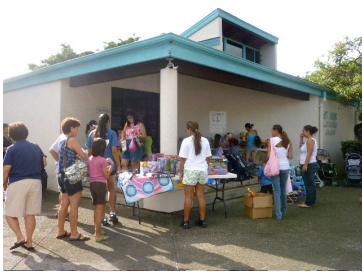
Long lines at the recent PTC Sponsored Rummage Sale

Jesus said to them, "My Father is always at his work to this very day, and I, too, am working." (John 5:17)