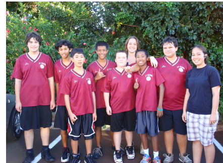
The Boys Varsity Volleyball team following the victory over Hanalei on September 17

Saint Mark Lutheran Church is back to two services: traditional service at 8:30 a.m., and contemporary service at 11:00 a.m. Sunday school and adult Bible class start at 9:45 a.m. There are lots of ways your family can get involved at Saint Mark Lutheran Church and School!