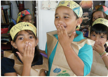
Kindergartners Playing Indians

Along with reading every day and working in our brand new thick first grade math books, the children are singing lots of Christmas songs and know their speaking parts for their Christmas program. There are also many art projects for Christmas: Santa mobiles, Rudolph the Red Nosed Reindeer, shoe box stables with nativity scenes, and angels made from paper plates. The children left carrots for St. Nick's horse on Dec. 6 and they will have a posada for their Christmas party—that's a Mexican Christmas Celebration.