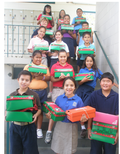
5th graders with gifts for some of the less fortunate