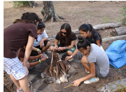
8th graders trying to start a fire during their Camp Erdman trip

7th Grade Drama students performed "Turkey Saves the Day" for the school on Nov. 25. They are now rehearsing "Santa Strikes" and "The Birthday Party" which will be performed on the morning of December 19th.