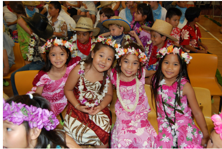
First Grade Girls Enjoying themselves at May Day

First Grade: The first graders are looking forward to the special end-of-the-year activities we've planned. Our classroom will be transformed into "Camp Learned-a-lot" with blankets, pillows, and a make-believe campfire. We'll tell stories and reminisce about our year together. Our camp-out wouldn't be complete without smores and hot dogs! We're also having a silent