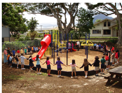
The Dedication/Blessing of the New Playground on April 27

wonders and works of Jesus' creation. Flyers advertising VBS were sent home with students and are available on-line at www.smls-hawaii.org . Please call the church office at 247-4565 if you have any questions.