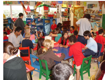
Kindergartners and 8th Graders having an Ice Cream Party

Grades 6 - 8 are all preparing for their last tests in American History and Math.