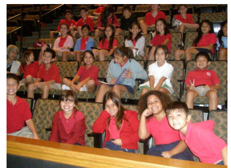
5th graders having fun during a school field trip

One wagon train never made it, but was stranded in High Valley after a severe snowstorm and all members perished there. This was an enjoyable study as fifth graders gained an appreciation for how difficult it actually was traveling west on the wagon train trails during the 1850's.