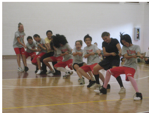
Eighth graders participating in the tug-of-war.

The 2007-2008 Spirit Week was a ton of fun and included class devotions with refreshments and theme days such as crazy hair day and UH appreciation day. The exciting week culminated with Friday activities and the all Lutheran Schools' Music Festival at Leeward Community College.