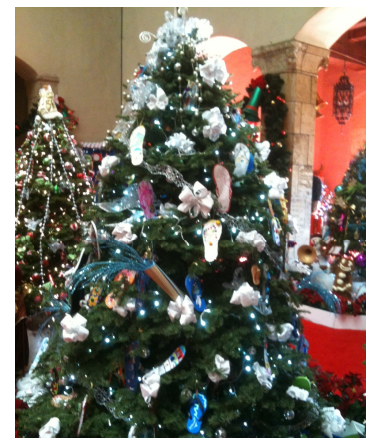
Honolulu Hale Tree Adorned with Saint Mark Decorations

using the paper slippahs which our fifth grade drew as ornaments along with the slippah box that the fourth grade made for the fundraiser gala. The result was fantastic and appreciated by all!