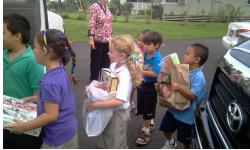
Kindergartners Loading the Salvation Army Van with Christmas Toys