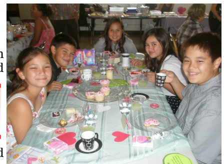
Grade 5 Students Enjoying High Tea with Their Parents

with an exchange of valentines and much appreciation for each other.