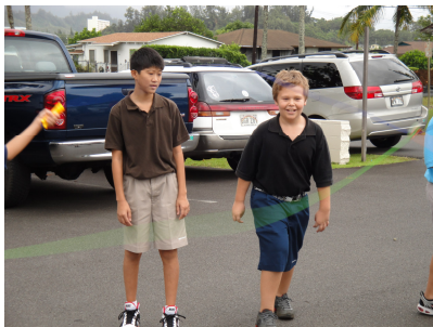
Junior High Students Having Fun at the "Get Active" Day

Saint Mark raised over $5,000 for the "Get Active" - a two week campaign to promote physical activity and raise money for Saint Mark athletics. Students took part in an hour long "Get Active" physical activity session on February 16 followed by an all-school potluck. Awesome job everyone!