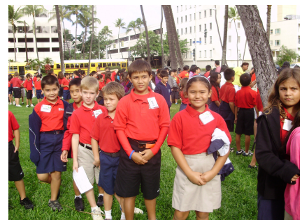
3rd graders at the recent trip to the Hawaii Youth Symphony