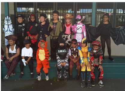
1st graders showing off their Halloween costumes

Chapel offerings for October and November totaled over $375 which was donated to the Leukemia and Lymphoma Society .