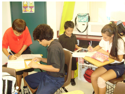
3rd and 8th graders working together on a bible project

We raised $150 by participating in the annual Nike 5K Fun Run for Kids! Thanks to all who supported Saint Mark though this event!