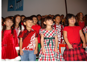
K-3 Christmas Program

Kindergartners have done lots of Christmas projects this month as they talk about the special meaning of Christmas and Jesus' birthday. On December 7 St. Nick's horse left treats for all the children, naughty children were to receive coal but of course no one got any. On December 15th the kin-