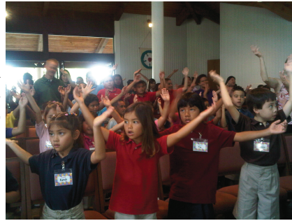
First Graders Enjoying Chapel

The first graders have accomplished many "firsts" in the first month of school. They have completed their first round of quizzes, our first mini-unit about getting to know each other, and are enjoying writing in their journals first thing every morning. We are looking forward to our first excursion, and are busy learning about our local community and the people that help to make it so special.