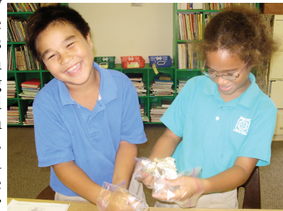
Third Graders having a lot of fun Investigating/Dissecting an Owl Pellet During Science

We are so blessed to have such an intelligent group of fourth graders. They have been extremely busy expanding their minds these first few weeks. The students have been working long and hard on their Pride Projects. These projects are fun for the students because they get to be a superstar for a day. I can't wait to enjoy their Pride Project presentations. The students are really enjoying their Hawaiiana Stud-