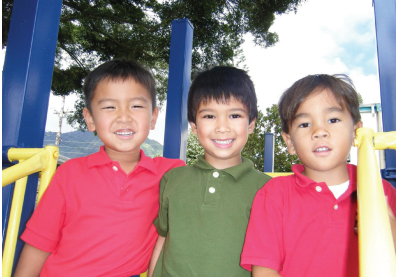
Kindergartners Having Fun

There are 26 enthusiastic kindergartners quickly making friends and learning school routines. We're working hard academically in reading readiness, math, and doing a big alphabet study: a letter a day. But on Friday afternoons we relax by having fun at the Kokokahi Pool.