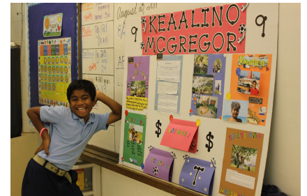
4th Grader Having Fun with His Pride Project

Thank you to all the staff that volunteered their time to make the night happen. They helped make Fall Family Night a huge success. We would not have been able to do it