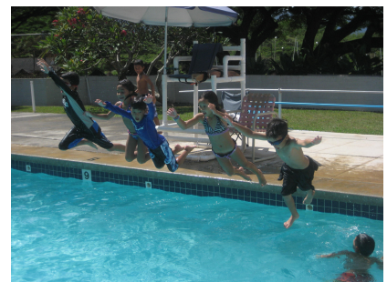
Grade 2 Having Some Fun at the Pool with Kindergarten

A big mahalo to all who supported our Scholastic Book Fair . We were able to buy more than 60 books and AR quizzes for our school library.