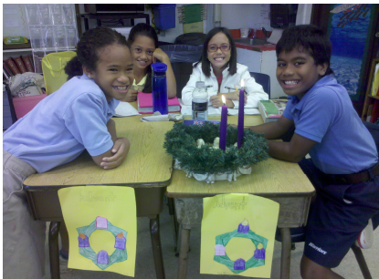
Grade 4 Students Around Their Advent Wreath

Third Grade: We have completed and ordered our class book entitled A Child's Guide to Hawai'i , and we are hoping they will be here by Christmas break. There is one order already on its way. We have been working hard in math using data to create different kinds of graphs. We have also been learning about the changes in Earth caused by erosion and weathering. We are planning a Christmas breakfast as part of our party scheduled for December 16. We are looking for old jigsaw puzzles, those with the small pieces that we could use for an art project. If you have any you