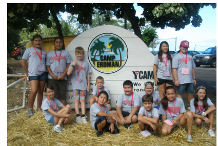
Grade 5 Students Enjoying Themselves at Camp Erdman