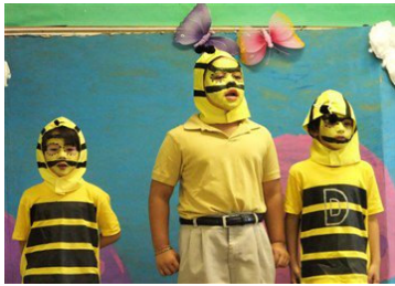
Grade 1 Garden Play

to look at all the beautiful lights, decorations and Christmas wreaths, and have a chance to listen to the Royal Hawaiian Band. We're excited