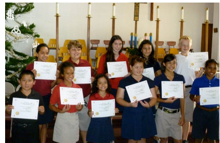
Spelling Bee Finalists

Remember to check our school website, Facebook Page, and teacher websites. The student photos are changed frequently and we'd hate for you to miss seeing your cute kids!