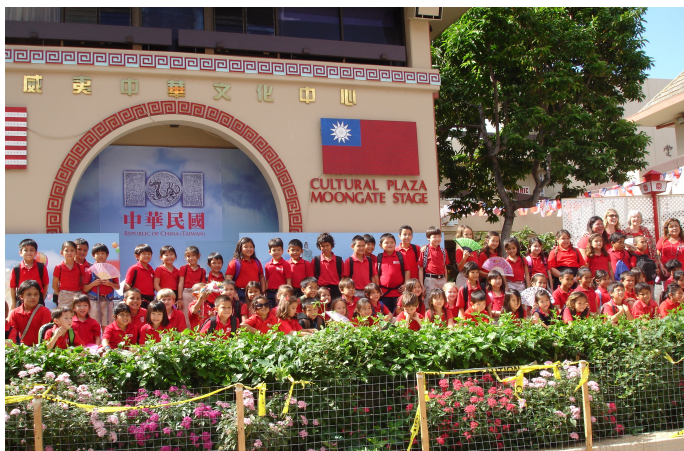
Grades K-2 on a recent visit to China town in celebration of Chinese New Year

duce rain. We thoroughly enjoyed our 100 th day of school when we celebrated all we've accomplished in the first one hundred days of school. We enjoyed a special "100 th Day" breakfast, counting games and activities.