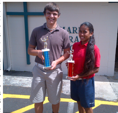
MVP's for varsity volleyball