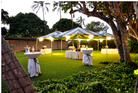
Sunset at the 1st Annual Benefit Gala at the Pacific Club

Mahalo to all who have generously given so much (time, talent, and financial contributions) in support of this important event!