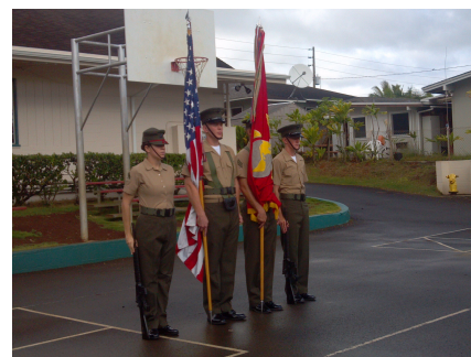
USMC Color Guard pays a visit to Saint Mark School

ing worship service on November 19th at 9:30 a.m. They will be singing songs of praise at this time of thanksgiving. Families are invited and during the sermon the children will have their own "keiki church."