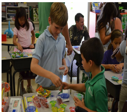
Grade 2 students buying and selling at their Open Market

Box Tops for Education has helped America's schools earn over $300 million since 1996. You can help Saint Mark Lutheran School by clipping box tops (making sure to include the expiration date and clip around the