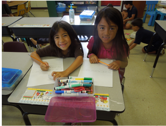
Grade 1 students collaborating on a creative writing assignment during class