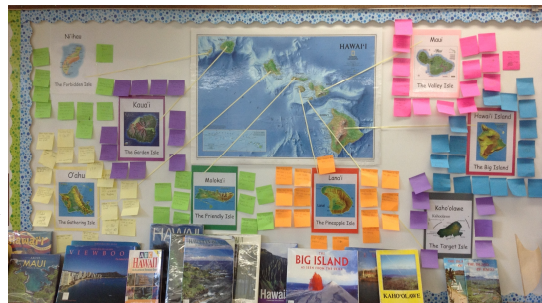
Grade 4 students used Post-It notes to share facts about our Hawaiian islands

the marsh area with nests to collect smaller animals that live in the wet-