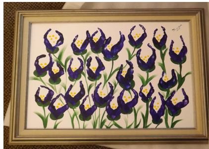
Class Project to be auctioned off at the upcoming Gala