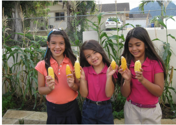
Grade 2 Students with Corn from their Garden

Kindergarten: Along with reading every day and learning how to do addition and subtraction, the children are singing lots of Christmas songs and know their speaking parts for their Christmas program. There are also many art projects