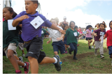
K-2 had a Blast Running in their 1st Annual Turkey Trot

Second Grade: The second graders are excited to be participating in a gingerbread person exchange with other second grade classes on the mainland! The students wrote to other second graders across the mainland and sent a decorated pa-