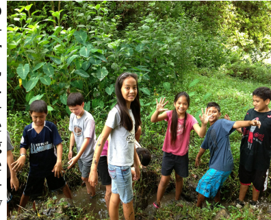
Grade 4 Students Getting Their Hands Dirty on a Recent Trip to Kualoa Ranch

season. Keep checking our weekly newsletter for other important, upcoming events. The students recently spent time writing a "Reading Rainbow" type book recommendation and are now taking turns recording each other on the iPads during class time. They are having lots of fun doing this project.