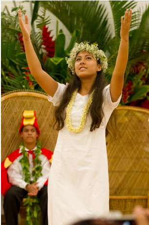
The May Day Queen dancing to "Palehua"

With the May Day Program, Big Island Trip, and Choir & Band Concert now behind us, it is about time to say good bye to 2011-12 and begin focusing on the new school year.