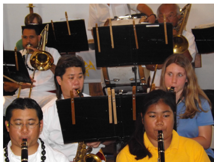
Saint Mark Students Playing with Royal Hawaiian Band

Saint Mark was recently treated to a special performance by the Royal Hawaiian Band. They played for nearly an hour and even invited the Saint Mark band to join them for a few songs.