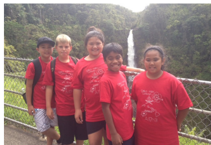
Grade 4 Students Enjoying the Akaka Falls Lookout on their recent Big Island Trip

(grade 8) who represented Saint Mark in this year's Middle School Honor Band.