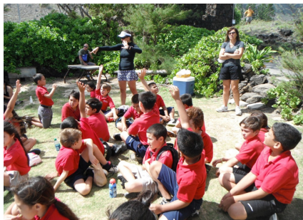
Third graders doing a drawing lesson at Makapu'u.

have also fit in a science unit on Properties of Matter and done division, solid shapes, lines, line segments, rays, and polygons and angles in math. By the time the break gets here we will definitely be ready for it. The next big event for the third grade will be preparing for May Day and our 2 nd Annual Wax