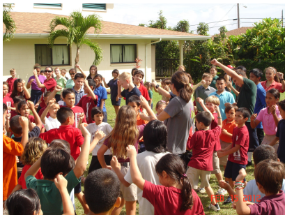
Students having fun doing Zumba at the "Get Active" Day

The "Get Active" promotion was a huge success with $4,400 being collected for the purchase of new P.E. and athletic equipment, recess balls, and travel, etc. The fundraiser culminated with a Get Active hour of physical activity held on February 15 and followed by the annual all-school Potluck Lunch. Check out the video of the students, faculty and staff doing Zumba on the Saint Mark Facebook page! Everyone was clearly having a ton of fun while GETTING ACTIVE. Thanks to all who supported this important event.