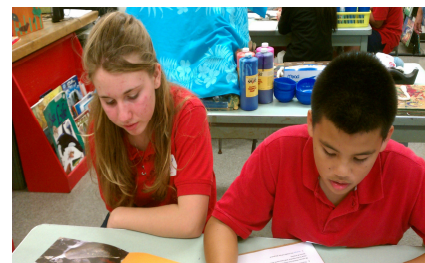
Junior High science students during a recent trip to visit the grade 3 students at Ben Parker Elementary

Sixth graders studied a unit on fossils. Experiments were completed to demonstrate the age of rock layers, radioactive dating, and excavating fossils. Currently the sixth graders are learning about water, water conservation, testing water samples, and have developed an awareness of water problems around the world.