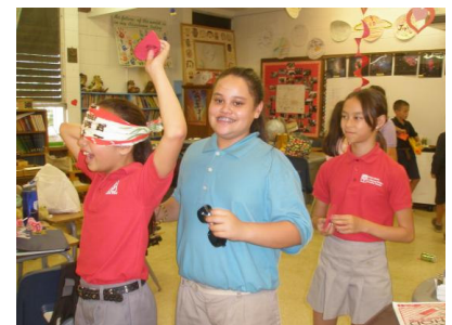
Grade 5 celebrating Valentine's day

ties. While there, our students will observe and participate in experiments and scientific demonstrations, including flight simulators and the launching of rockets that were built by each student. It's going to be a real BLAST!