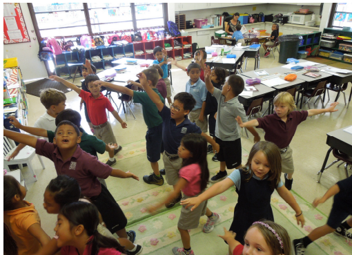
Grade 1 students starting their day with some fun singing and dancing

Make plans to attend the Fall Family Night on Friday, September 7. It will be a fun filled movie night!