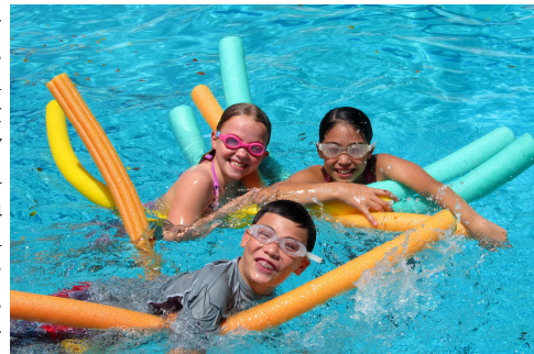
Grade 4 students enjoying themselves

students have already taken A.R. tests and several others are just about ready. They are working hard at becoming a group of children that can work efficiently together. They are still learning procedures but they are doing a great job! Way to go,