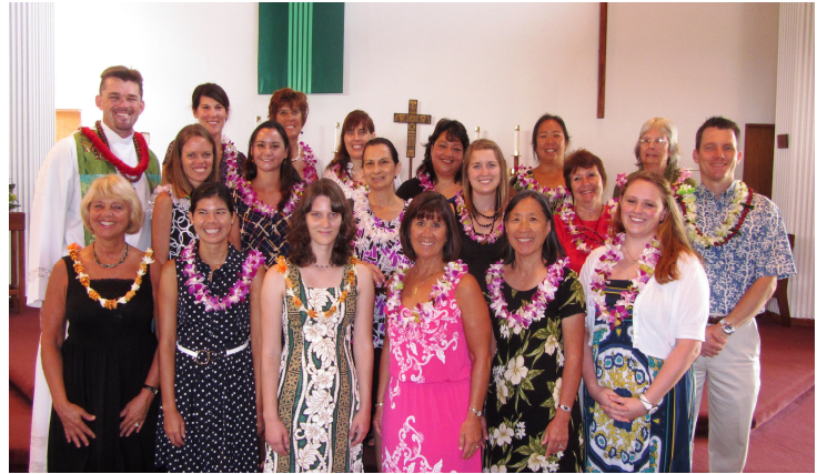
2012-2013 Faculty and Staff at the Installation and Rededication Church Service on August 5