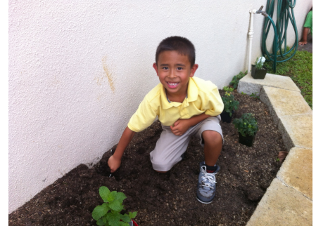
Grade 2 student having fun working in the Grade 1-2 Garden

ohana. During these first weeks of school, the students learned classroom routines and expectations, and they also spent time getting to know one another while building their classroom community. By putting together a puzzle, they learned that each one of them is a piece to our classroom and that each one is an important part of our ohana. The second graders are looking forward to learning lots of new things together this year.