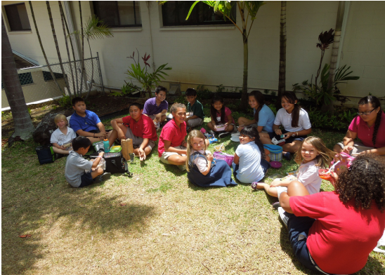
Grade 7 enjoying a wonderful outdoor lunch with their grade 1 chapel buddies

Our next Junior High Lock-In will be September 14th-15th. Save the date and be on the look out for more information coming soon