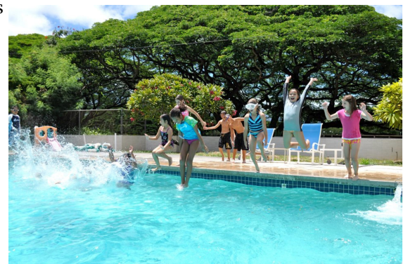
Grade 5 students having a blast swimming at the YWCA pool with our kindergarten students

Fifth Grade: Our fifth grade had a blast swimming at the YWCA pool with kindergarten. The sun was shining, the water was cool, and everyone had a wonderful time. Thank you to the many parent drivers that made our field trip possible. Mahalo from fifth grade!