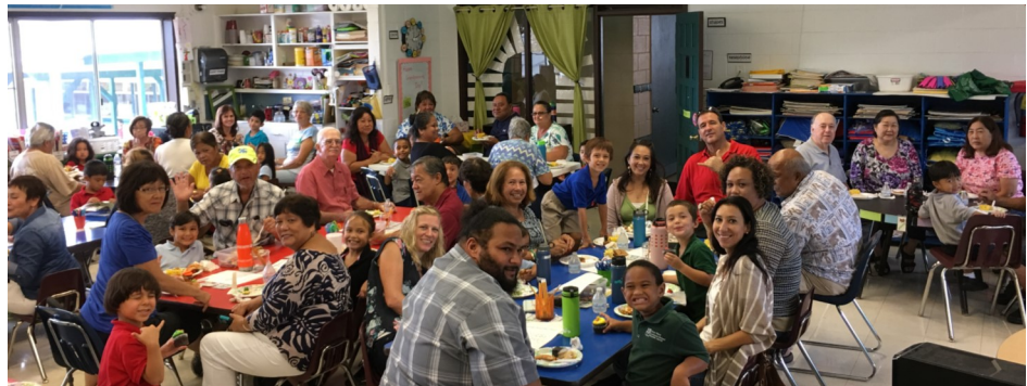
The Kindergarteners recently hosted a wonderful Grandparents' Day celebration

Report cards for students in grades 6-8 will be mailed home during Fall Break . Students in grades K-5 will receive their report cards when they return to school on October 17th .