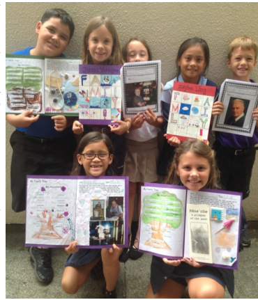
Grade 2 students show off their work studying their families

First graders have been busy! We began memorizing addition facts through Math Minutes and in reading we focused on word attack skills. We have also enjoyed reading Flat Stanley by Jeff Brown, as part of our unit on "communities". We will be sending off our "Flat first graders" to communities around the globe. We've also enhanced our swimming skills with swim lessons and learned ocean safety tips. We continue to