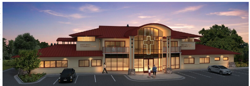
Renderings of the Early Education Center with 3 Pre-School Classrooms

Saint Mark continues its multi-year endeavor to raise money for the construction of a new early education building on the footprint of the current administrative offices, kindergarten room, and computer room. The architect is finalizing the plans for a beautiful building which includes three pre-school classrooms, a library, a technology center, meeting rooms, and administrative offices.