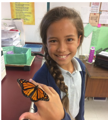
Grade 6 student showing off a butterfly that was born in the classroom

We are in need of donations for the silent auction at our seventh annual Benefit Gala . This year we will be "Celebrating the Fabulous 50's, Swinging 60's and Sensational 70's" . The event is on November 12 at 5:30 p.m. and will once again be held at the beautiful Pacific Club. We encourage any of you who would like to attend the Gala to come by the school office to purchase tickets.