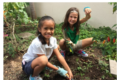
Grade 1 students in the garden

Mahalo to all who supported and volunteered for our Scholastic Book Fair . It was very successful with sales of a little over $4500. We will use the profits to buy additional books for the school library.