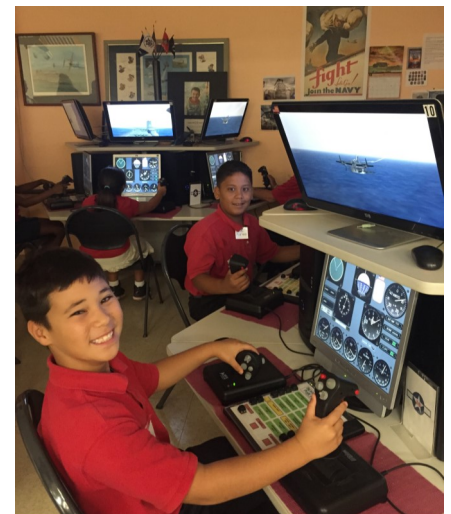
Grade 5 students enjoying themselves at the Aviation Museum

tween that and spending time at the Aviation Museum, we are having a great time & learning a ton.