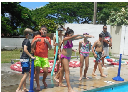
Grade 5 students recently enjoyed a quick swimming excursion with the kindergarteners

Fifth Grade: Our fifth grade had a blast swimming at the YWCA pool with kindergarten. The sun was shining, the water was cool, and everyone had a wonderful time. We think it might be the best PE class that we'll have all year! Thank you to the many parent drivers that made our field trip possible. Mahalo from Fifth Grade!