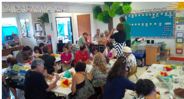
Kindergarten students sharing a very special visit from their grandparents on Grandparents Day

Report cards for students in grades 6-8 will be mailed home during Fall Break. Students in grades K-5 will receive their report cards when they return to school on October 13th.