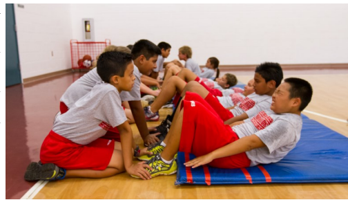
Grade 6 students working hard in P.E. doing their sit-ups

Eighth grade Bible class has finished unit 1 of the Old Testament curriculum and have taken the unit test. Now students are focusing on the Law and Gospel aspects of each lesson and how to apply it to their own lives. They continue to work closely with their kindergarten buddies and escorted them to the Book Fair to help with their wish lists.