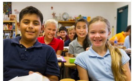
Middle school students smiling for the camera

We are still in need of donations for the silent auction at our Benefit Gala . The event, " Kulia I Ka Lani - Strive for the Heavens " on November 8 at 5:30 p.m., will once again be held at the beautiful Pacific Club. We encourage any of you who would like to attend the Gala to come by the school office to purchase tickets.