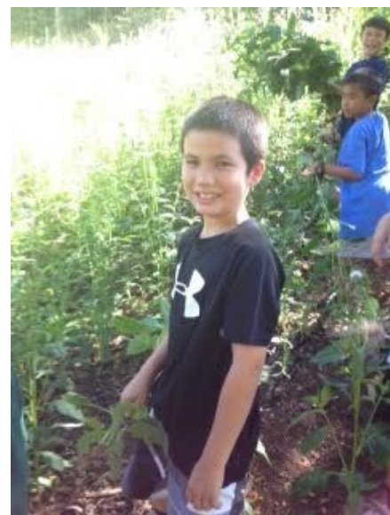
Grade 4 students spent some quality time working at Kualoa Ranch