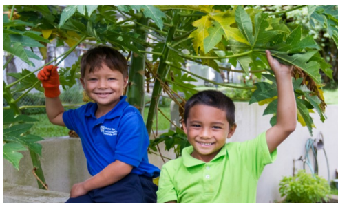
Grade 1 students working in the grade 1 & 2 class garden

Second Grade: Second graders have been very busy this month. They went swimming with kindergarten and had a lot of fun! The students are also excited to be learning about money in math as they will be putting those skills to work during their very first open market on September 26. The second graders are also eager to learn new and challenging words from our new Wonders curriculum. If you see a second grader ask them what onomatopoeia means! The class will be ending the first quarter by completing a family project which they have started at home.