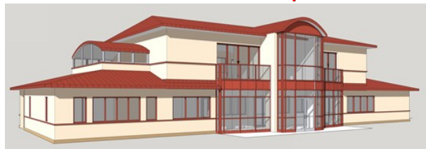
New Renderings of Early Education Facility

Saint Mark continues its multi-year endeavor to raise money for the construction of a new early education building on the footprint of the current administrative offices, kindergarten room, and computer room. The architect has developed a beautiful building which includes three pre-school classrooms, library, technology center, meeting rooms and administrative offices.