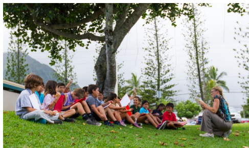
Grade 3 students spent some time reading a story under a beautiful tree

Third Grade: Third graders have had a busy month. We went on a very exciting field trip to visit a wetlands where we studied Hawaii's endangered birds as well as why wetlands are an important part of our world. In math we have been working very hard learning how to count money and give change. We