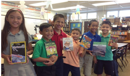
Grade 3 students showing off the books they selected for their first Book Report of the school year

Third Grade: Third grade has been working on mental math this month but soon we will be heading into multiplication! We had a wonderful visit from the fire department in October where we learned about fire safety and the importance of knowing