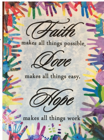
Grade 1 Class Project for this year's Gala

Mahalo to all who have generously given so much (time, talent, and financial contributions) in support of this important event!