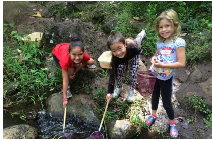
Grade 1 students enjoyed a trip to the Hawaii Nature Center

Kindergarten: The kindergartners jumped right into the second quarter after their fall break, and are ready to learn! This second quarter promises to be very busy and fun. We learned about fire safety from our friends from the Honolulu Fire Department. We sang in Sunday church service and will be visiting the Waimanalo Pumpkin Patch, and having a Halloween party and costume parade - all in the month of October! The kindergartners are also looking forward to learning about how their bodies work and being healthy, as they begin a new unit in science.