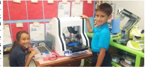
Grade 2 students using their new 3-D printer to create objects from solid plastic

other states. They brought back maps which we will use to learn map skills. Second graders also began a project about Jesus and have created amazing artwork depicting His life. They are excited as