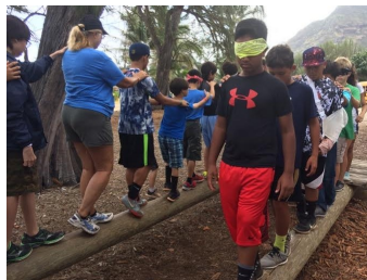
Middle school students at Camp Erdman

In sixth grade earth science , we built earthquake-resistant houses and had lots of fun testing them! We are now studying volcanoes. We finished our chapter on modern genetics