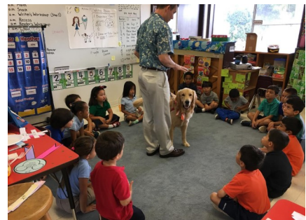
Kindergarten students enjoyed a visit from Saint Mark's Therapy Dog in Training "Koa"

The Geographic Bee and Spelling Bee will be held in January. This