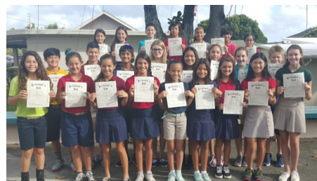
"Principal List" for the 1st Quarter

In pre-algebra , the seventh and eighth graders continue their study of fractional operations as they begin some in-depth work with ratios, proportions and percentages. This will assist them in find-