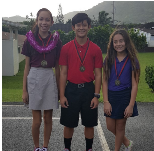
"Warriors of Quarter" for the 1st Quarter

Seventh grade math students just finished a tough chapter on equations and inequalities. We will be learning about ratios, rates, and proportions in the next chapter. Eighth grade algebra students just finished a chapter on solving inequalities and are now studying graphs and functions.