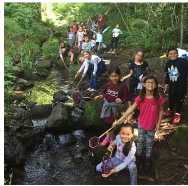
Grade 2 students fishing at the Hawaii Nature Center

First Grade: The first graders built a thankful list last month as we prepared for the wonderful Thanksgiving holiday. Our class enjoyed a thanksgiving feast of homemade squash chicken stew with our first grade `Ohana. The K-5 annual Turkey Trot was a huge success as well as our drive to collect canned goods for our Church foodbank. The first graders also participated in completing over 8 operation Christmas Child shoeboxes that will be sent to needy children around the globe as well as share the love of Jesus with them. We especially loved hearing back from our "Flat Firsties". They traveled near and far which served as a springboard into our unit on geography. The K-2 classes are rehearsing in preparation for their Christmas Concert by learning new songs and memorizing speaking parts. We know it will be a