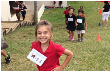
Grades K to 5 enjoyed Saint Mark's 5th Annual Turkey Trot

Everyone is invited to the wonderful Christmas programs put on by our students. We've already enjoyed the K-2 Christmas program . The 3-4 grade Choirs & Beginning Band Christmas program is on Tuesday, December 13th at 6:30 p.m. and the Grades 5-8 Choirs & Advanced Band Christmas Program is on Thursday, December 15th at 6:30 p.m.