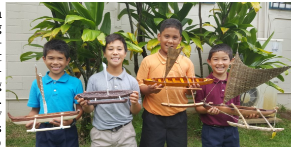
Grade 4 students excitedly showing off their homemade ancient Hawaiian canoes

Fourth Grade: The fourth graders have been working hard on a Hawaiian Studies project for the past month. Each student created a canoe model using any materials they wanted. The students were very creative and used all kinds of material; from plastic to drift wood and corks to banana husks! They needed to include important parts of the canoe and it needed to be able to float. The fourth graders gained a tremendous amount of knowledge about special outrigger