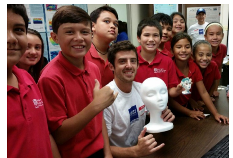
Grade 5 students enjoying a recent learning trip to U.H.