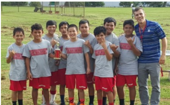
The Saint Mark J.V. Cross Country team placed 2nd in their recent meet

Everyone is invited to the wonderful Christmas programs put on by our students. We've already enjoyed the K-2 Christmas program . The 3-4 grade Choirs & Beginning Band Christmas program is on Tuesday, December