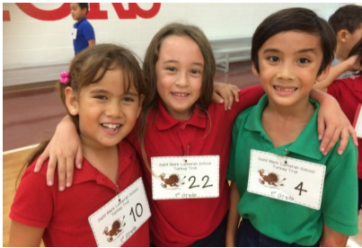
Grade 1 students enjoying the Turkey Trot

tribe and the Pilgrims who celebrated the first Thanksgiving. We studied how life for a child was then compared to life now, and we enjoyed a thanksgiving feast with our kindergarten friends. The K-2 Tur-