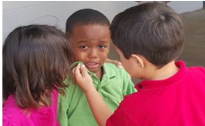
One kindergarten student wiping away the tears of another

For me, as I think back on the past year at Saint Mark, my mind is immediately flooded with imagery of the daily ups and downs that comprise an elementary/middle school setting. Specifically, I see images of smiling faces and tearing eyes. I see problems develop and problems solved. I see frustration and failure one moment then gratification and success the next. I see students get knocked down and then get right back up. I see empathic students supporting and consoling one another in powerful and endearing ways. I see true collaboration where students advocate and argue in one breath and then graciously concede and capitulate in the next. I see uncertainty and trepidation transformed into confidence and resilience. I see students and teachers who learn and grow together. Most importantly, I see Christ's gospel love entering our students' hearts in ways that will far outlast the rigors of the A, B, C's and 1, 2, 3's.