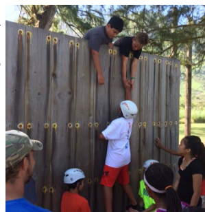
Middle school students at Camp Erdman

Eighth grade U.S. history completed their study of the Civil War and Reconstruction. The students led discussions about the development of institutional racism in the South. This information will be important when they study the Civil Rights Movement later in the year. Their last unit is the displacement of Native Americans & the Trail of Tears.