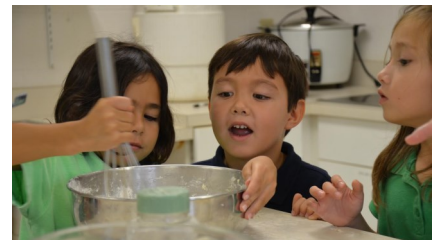
Kindergarten students enjoyed a recent baking activity

Now that we are dealing with some cold weather we wanted to remind everyone that the dress code states students are only al-