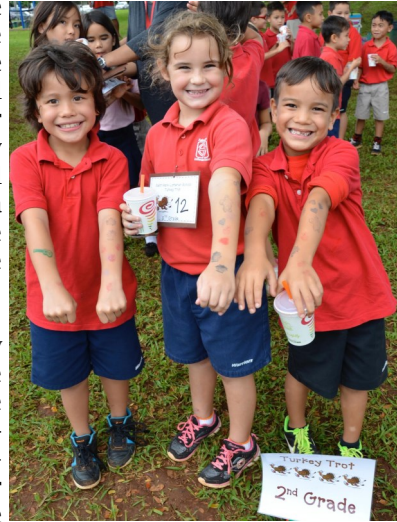
Second graders at the Saint Mark Turkey Trot

tation, the BFG play at the University of Hawaii, the Turkey Trot at the district park and the Hawaii Youth Symphony. The second graders are also working very hard to complete our very first animal research paper. We are making models of our animals and we are excited to share it with you all. The class also started learning how to regroup in math and have memorized all of their lines for the Christmas program.