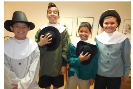
Grade 5 students dressed in their colonial outfits