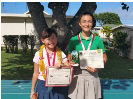
Congratulations to the winners of the Geographic Bee on December 11

gram. The 3-4 grade Choirs & Beginning Band Christmas program is on Tuesday, December 16th at 6:30 p.m. and the Grades 5-8 Choirs & Advanced Band Christmas Program is on Thursday, December 18th at 6:30 p.m.