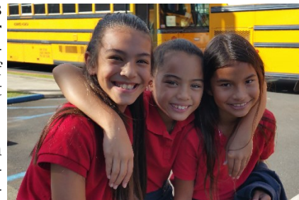
Grade 4 students excited to be going to the Youth Symphony

Fourth Grade: The fourth graders have been researching a plant or animal that lives in Hawaii. With their completed research they are creating a book on our iPads. These iBooks are filled with information they learned about their special plant or animal. They are writing about the physical characteristics, the habitats, how the early Hawaiians used