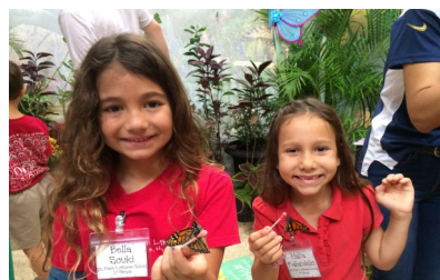
Grade 1 students visit the exciting Butterfly Conservatory Exhibit

Office hours during the summer break will be Monday - Friday from 8:30 a.m. to 1:30 p.m.