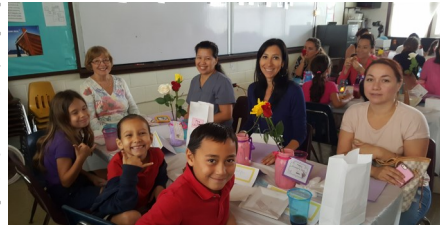
Grade 1 and their Mothers enjoyed a wonderful Mother's Day Tea!

cited to begin building their Meccano robots that were given to them by the PTC. In math, they are learning the concepts of multiplication and division to help them get ready for third grade. The students also studied the importance of the Bible and made a music video about it. In addition, they worked hard on an eight-page report about a famous person they chose to study. They came to school dressed up as their person and gave a presentation in front of the class. It was fun yet informative for everyone. The students also took a field trip to the Lucoral Museum and learned all about different types of rocks and minerals and toured a "cave" that featured real dinosaur fossils and eggs. Lastly, they made bracelets using real gemstones and presented it to their mothers for Mother's Day.