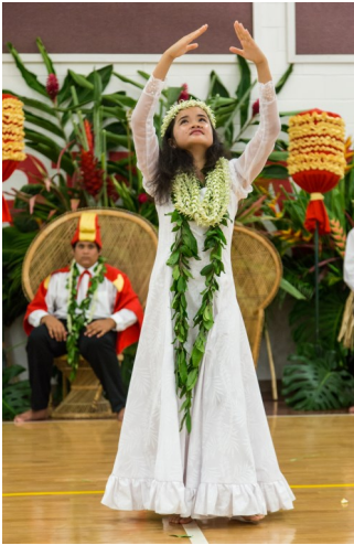
The May Day Queen dancing to "The Prayer"

With our May Day celebration, Big Island trip, and spring concerts behind us, it's nearly time to bring the 2015-2016 school year to a close. It has been another busy year full of countless learning activities, excursions, and other educational opportunities for our students. In addition to the numerous learning opportunities afforded to our students, Saint Mark's faculty, staff and administration also participated in an immensely important educational experience this year.