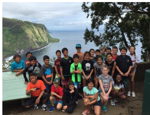
Grade 4 students enjoyed a beautiful visit to Waipi'o Valley on the Big Island