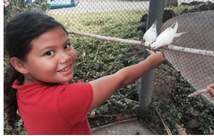
A grade 1 student had a great opportunity to feed a couple of birds during a recent learning trip to Sea Life Park

Kindergarten: The kindergarteners had a spectacular school year packed with learning, making friends and having fun! These last couple of weeks of school have been filled with special activities and memories such as swimming at the Kokokahi YWCA, performing a patriotic play, publishing a class book about peace, singing for their parents at the K-2 Spring Concert, and watching chicks hatch and grow. They are excited about a learning trip to the VCA Animal Hospital, their kindergarten graduation, end of the year celebration at the beach, and meeting their first grade teacher. These "almost