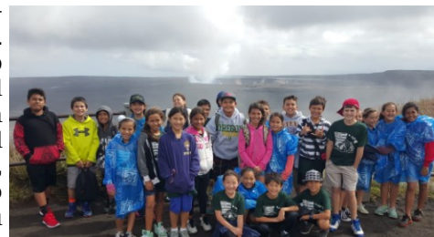
Grade 4 students enjoyed an chilly visit to Kilauea crater at Volcanoes National Park on the Big Island

Fourth Grade: The fourth graders had a BLAST on the Big Island! On our first day we explored Hawaii Volcano National Park. We got up close and personal with sulfur and steam vents, looked into Halemaumau crater, and walked through an old lava tube. On the second day we stopped at Hawaii Botanical Gardens, Akaka Falls, Pu'ukohola Heiau, and Puako