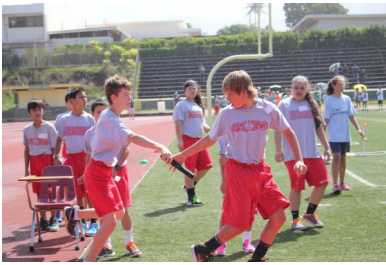
Two middle school students racing during the recent LSSL Track Meet

Sixth grade science students just finished debating which energy resource is best for Hawaii. We will be studying our solar system next. Seventh grade science students are studying a complex chapter about our body's nervous system and eighth graders just finished a chapter about energy. We will be studying the characteristics of waves next.