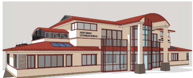
Preliminary Rendering of the Future Early Education Facility