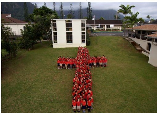
All students, faculty & staff gathered for this wonderful picture

Please remember that our uniform store, Campus Creations is very busy during the summer. So do not wait until the last minute to purchase next year's school uniforms. Call Campus Creation at 484-9191 to inquire or place an order.