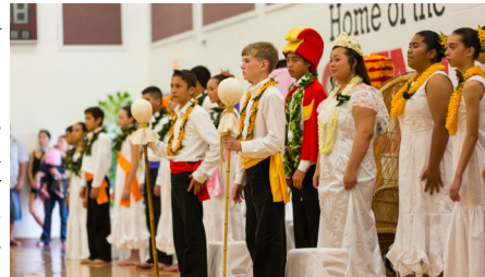
The 2014 May Day Court

Seventh grade is finishing their country research paper while studying China, Japan, and India. Eighth grade completed a historical fiction paper and is covering WWII,