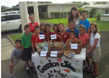
Grade 1 and 2 students had an extremely successful Garden Sale

Please do not wait to the last minute to purchase next year's school uniforms. Call Campus Creation at 484-9191 to inquire or place an order.