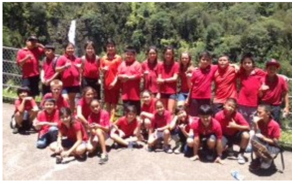
Grade 4 students at Akaka Falls during their recent trip to the Big Island of Hawai'i

Third Grade: The third grade students started off the month of April by learning fractions and measuring perimeter and areas. We have had lots of fun writing persuasive and expressive paragraphs and learning how to edit our own work. The students came up with the idea to start their own book & poem clubs! In art, we have been illustrating books. We started May by performing our hula in homemade ti leaf skirts which many students had a part in making. In choir, we learned some