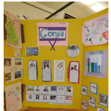
Grade 5 State Project on Georgia

gy, organization, and oral language as well as visual design to complete their state project. We will end our study by learning all the fifty states and abbreviations. Hopefully, one day, they'll get to visit all of them!