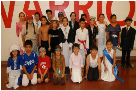
Grade 3 Wax Museum

Third Grade: The third graders held the 3 rd Annual Wax Museum, Thursday, May 16 in the school gym. Students from Saint Mark came to the "museum" to hear about historical figures that the third graders wanted to research. Parents visited during the dress rehearsal on Wednesday and during the event on Thursday. It was great. It is difficult to stand in front of people and speak, but the students did a great job memorizing and sharing orally the information they learned. The