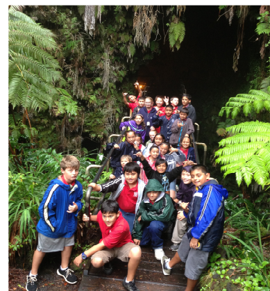
Grade 4 students enjoying the Thurston Lava Tube on their recent Big Island Trip

We bid a fond farewell to our graduating eighth graders as they begin their journey to high school. Some of the schools these students will be attending are: Hawaii Baptist Academy, Kamehameha, Le Jardin, Lutheran High, Saint Francis, Maryknoll, and Punahou. Congratulations!!!