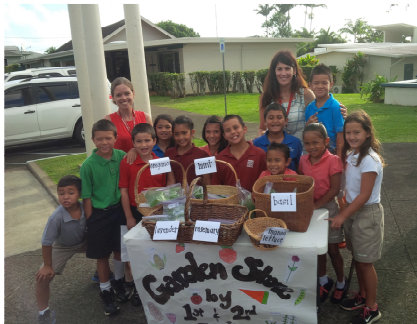
Grade 1 and 2 students had an extremely successful Garden Sale

Chapel offerings for April totaling $395 went to the Make a Wish Foundation . As always, we greatly appreciate your generosity!