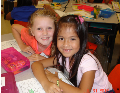
Grade 2 students on the First Day of School - July 31, 2012

When I pick up the new yearbook every May, it never ceases to amaze me how different the students appear. Without fail, the looks of almost every student has noticeably changed from the beginning of the school year to the end. Some students have more teeth; some have fewer teeth; some are taller; while some simply look more mature. However, the changes do not stop with physical appearances. The students have also grown spiritually, intellectually, socially & emotionally. It is a true joy to watch the students develop and progress in so many meaningful ways.