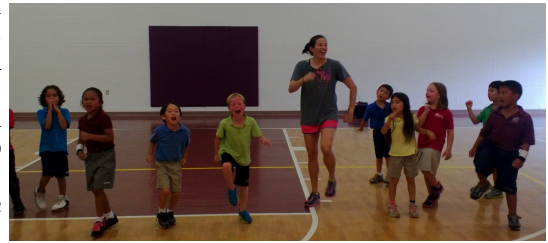
Grade 1 & 2 students getting some wonderful exercise doing Zumba