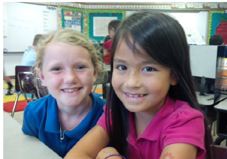
The same Grade 2 students near the Last Day of School - May 21, 2013