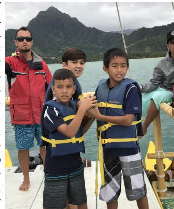
Grade 4 spent an educational day with the Kanehunamoku Voyaging Academy

Fourth Grade: The fourth graders had wonderful stories to tell about their winter break. Many students traveled and visited families. Upon returning to school the fourth graders wrote their quarter reflections and made resolutions for the new year. The third quarter has proven to be difficult in math. The students are beginning to learn how to do long division and although it might seem daunting they are slowly beginning to understand it. They are also learning how to write a type of opinion essay in the form of a PSA or public service