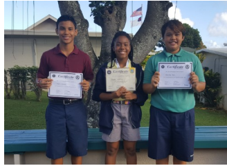
Congratulations to our Geographic Bee Finalists