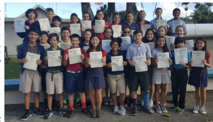
Congratulations to the middle school students who earned the 2nd quarter principal's award or spots on the principal's list