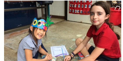
Students in grades 1 & 4 celebrating the 100th Day of School

forward to diving more into social studies this quarter and sharing what we learn through some type of project. The best is yet to come!