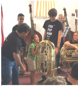
SMLS students enjoyed a wonderful concert by Concordia University

First Grade: 2017 has begun with an eager group of fabulous first graders ready to learn new things. We started the year off by setting New Year's Resolutions. And now the first graders are ready to begin Accelerated Reader (AR) like the big kids. They will start slow and begin surfing through AR in no time! This month, the first and fourth graders celebrated the 100 th day of school by sharing a 100 th day snack, STEM activity, and a few even came dressed as a 100 year old person. We enjoyed our field trip to the Kaneohe Library, where the children learned about checking out books and heard a story or two. We kicked off "Get Active" this month and are challenging each other to "Raise Money, Get Active and Have Fun!"