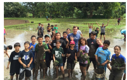
The grade 4 & 5 students enjoyed an educational and DIRTY learning trip to the Waihe'e Poi lo'i in Kaha'u'u