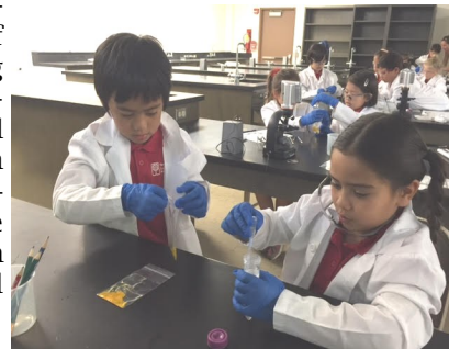
Grade 2 students having a blast at UH learning how to extract DNA from a papaya

on the cars, create a graphic organizer and write a final paper on it. The students also used the information that they had received to create and design their own, "concept car" blueprint. The second graders are also learning about telling time and creating different