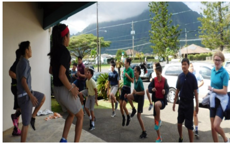
Middle school students were having some healthy fun during the recent "Get Active Day!"