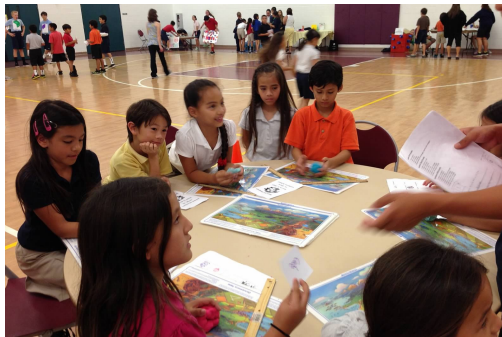
Grade 2 students enjoying the Math Fair put on by the Jr. High Students