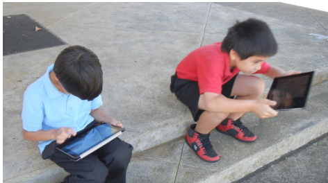
Grade 3 students doing an outdoor activity with the iPads

Third Grade: The third graders did a wonderful job with their president reports in the middle of February. Each child did research on a president and then did an oral presentation before the class and parents, sharing what they had learned. We have been working on geometry in Math and used the iPads to scan QR codes for clues about what angles or kinds of lines they needed to look for on our campus. Then they