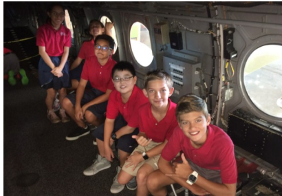
Students enjoying a recent learning trip to the Aviation Museum

Seventh grade social studies students are learning about world geography. Although it can be somewhat tedious, our seventh graders have taken it in stride and have performed very well on their first quiz. Right now, they are learning about the physical features and early people of the United States and are using outlines to write down all the information they learned from our textbooks and during lectures.