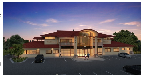
Renderings of the Early Learning Center to include pre-school classrooms, library, technology center, meeting rooms and administrative offices

October 19 & 20: 11:30am dismissal due to Parent Teacher Conferences