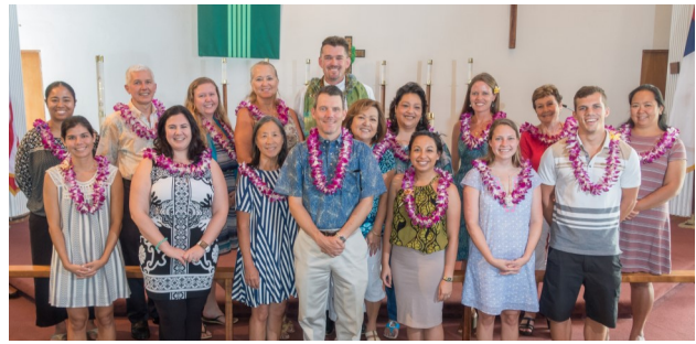
2017-2018 Faculty and Staff at the Installation and Rededication Church Service on August 6

Their first game is on Tuesday, August 29 here at Saint Mark against Pearl Harbor at 3:30 pm. You can find the rest of their games on the school's website calendar at smls-hawaii.org .