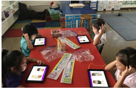
Kindergarten students completing literacy activities on the iPads

We are diving right in to our kindergarten year! We have started off the year by learning our rules, procedures, and essentially how to be an awesome student. We are getting the hang of the "Big Kids' School," and how to be a member of the school community. We are practicing our numbers, letters, sounds...and we've even started reading! We are learning about Bible and social studies, and we just found out that we are SCIENTISTS! Also, we went on our first field trip to Hawaii Theatre for Youth, to see The Ballad of Mulan . It was awesome and a great experience for us! Kindergarten is ready to learn, make new friends, and get smarter and smarter!