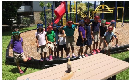
Grade 1 students enjoying their first science experiment