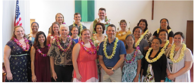
2016-2017 Faculty and Staff at the Installation and Rededication Church Service on August 7

JV volleyball for boys and girls will be played during the second quarter, varsity basketball during the third quarter, and JV basketball during the fourth quarter. Cross country for 5th-8th grade boys and girls is being scheduled for either November 17 or 18. More information will be forthcoming.