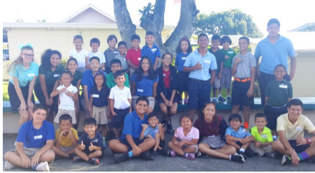
Kindergarten students meet their grade 8 chapel buddies