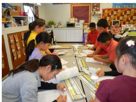
Grade 3 students investigating states of matter in a recent science lab

Third grade: A few weeks ago the third graders had a great science lab as they explored some substances and had to figure out if they were liquids or solids. They learned a new word, "colloid" that day. Ask them what it is. We walked to the Kaneohe Public Library last Friday 4/12 to gather information for our Wax Museum.